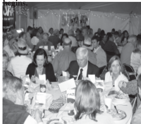
Below top: Supporters enjoy O'Charley's repast. Congressman Jimmy Duncan is seated at center table. Lower: Prospective bidders preview items before auction action begins.

In every way, it was a magical night and we would like to extend special thanks to O'Charley's and their crew, as well as all of our event sponsors: Addicks CPA Firm, Skier's Choice, A Beautiful Room, Knoxville Orthopedic Clinic, Carpe Librum, Broadway Sound, Mayfield Dairy, and Advanced Medical Group.